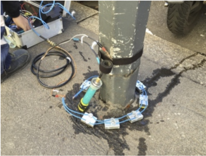
Street light poles condition research